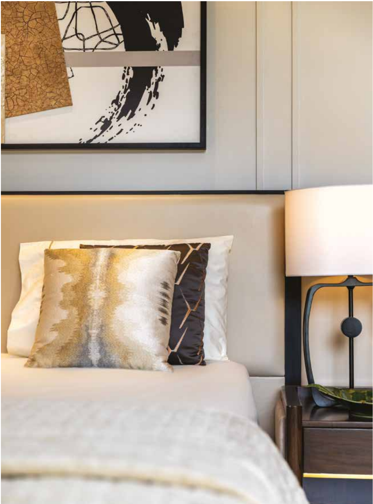
Actual Image: Independent Floors - Bedroom

All fittings, fixtures and furniture shown are for representation/illustrative purposes only.