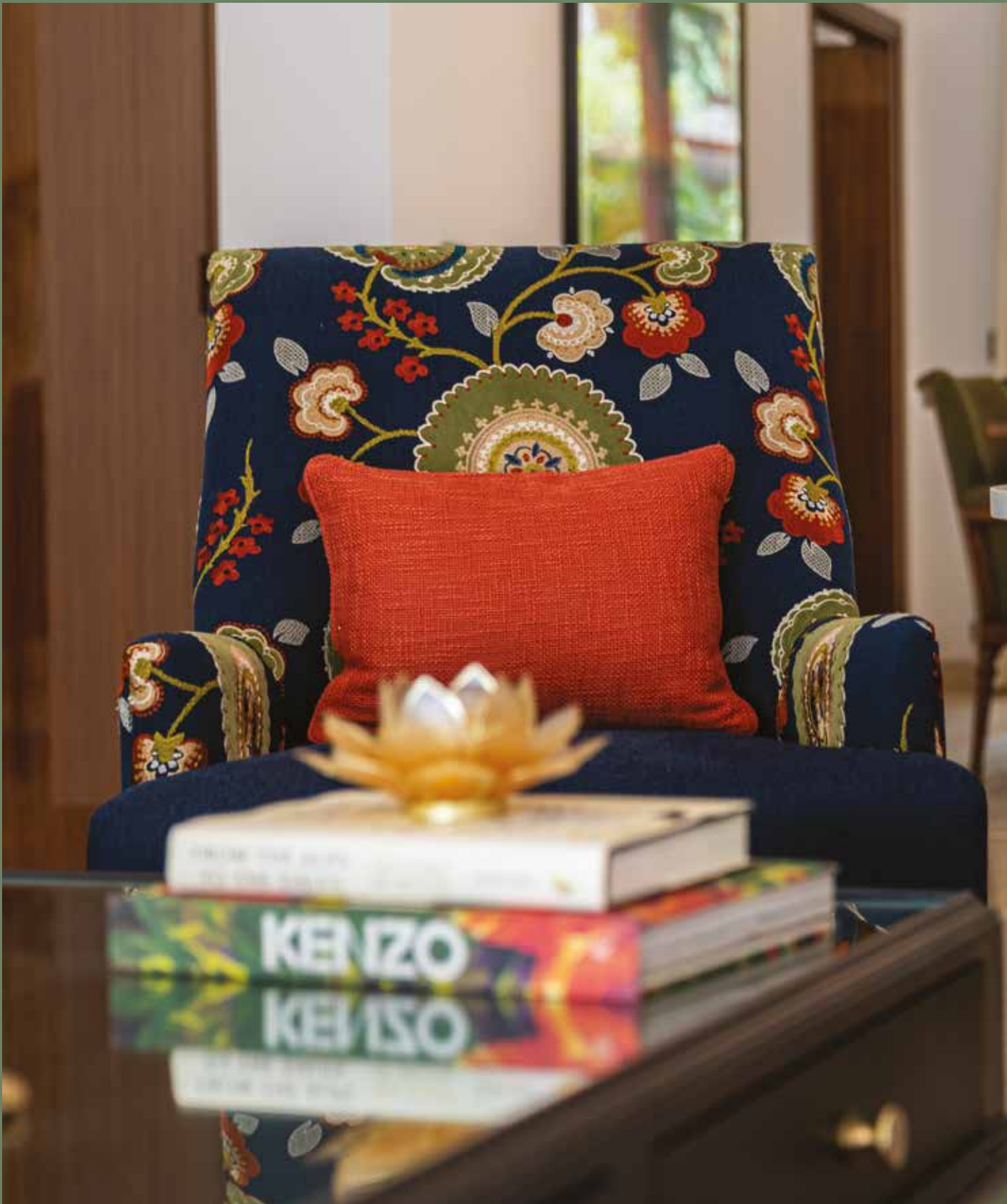
Actual Image: Independent Floors - Living and dining areas