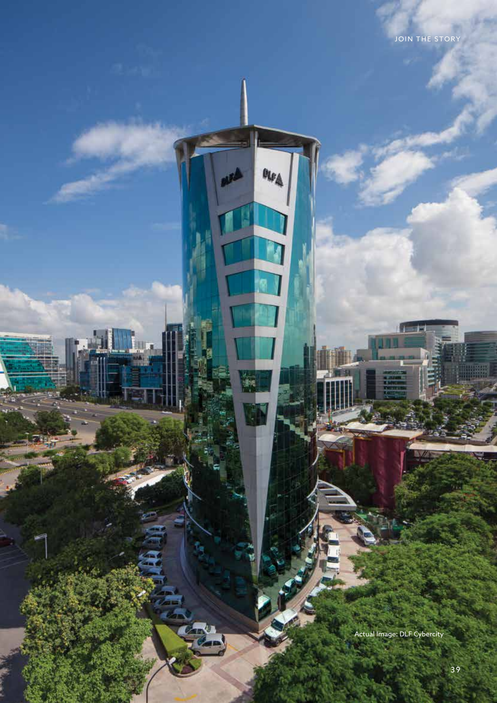
Actual Image: DLF Cybercity