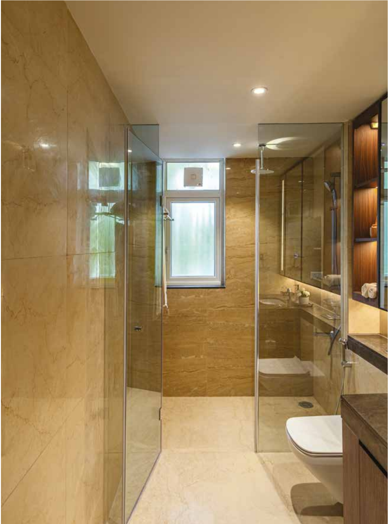
Actual Image: Independent Floors - Bathroom

All fittings, fixtures and furniture shown are for representation/illustrative purposes only.