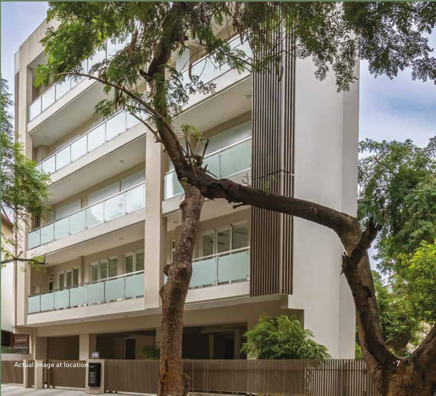
Actual image at location

Tucked away amidst these low-rises lies an exquisite selection of homes, providing unparalleled privacy, abundant natural light, enhanced cross-ventilation, and breathtaking vistas in proximity to beautiful parks and green spaces. Every dwelling is meticulously crafted to encompass dedicated staff and storage spaces in the lower levels, in addition to secure parking spaces.