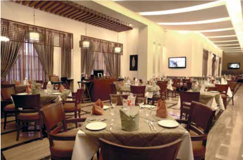
Actual image: The Restaurant