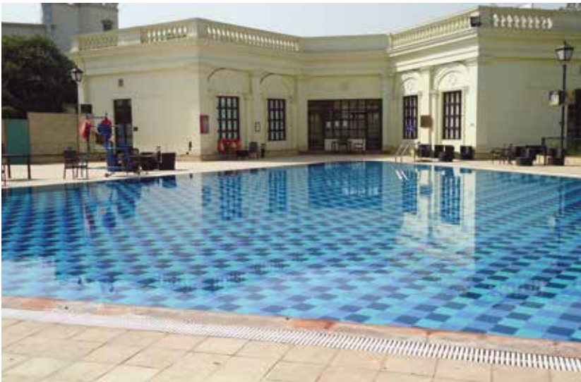
Actual image: Pool and lounging area

Immerse yourself in an exciting and dynamic lifestyle