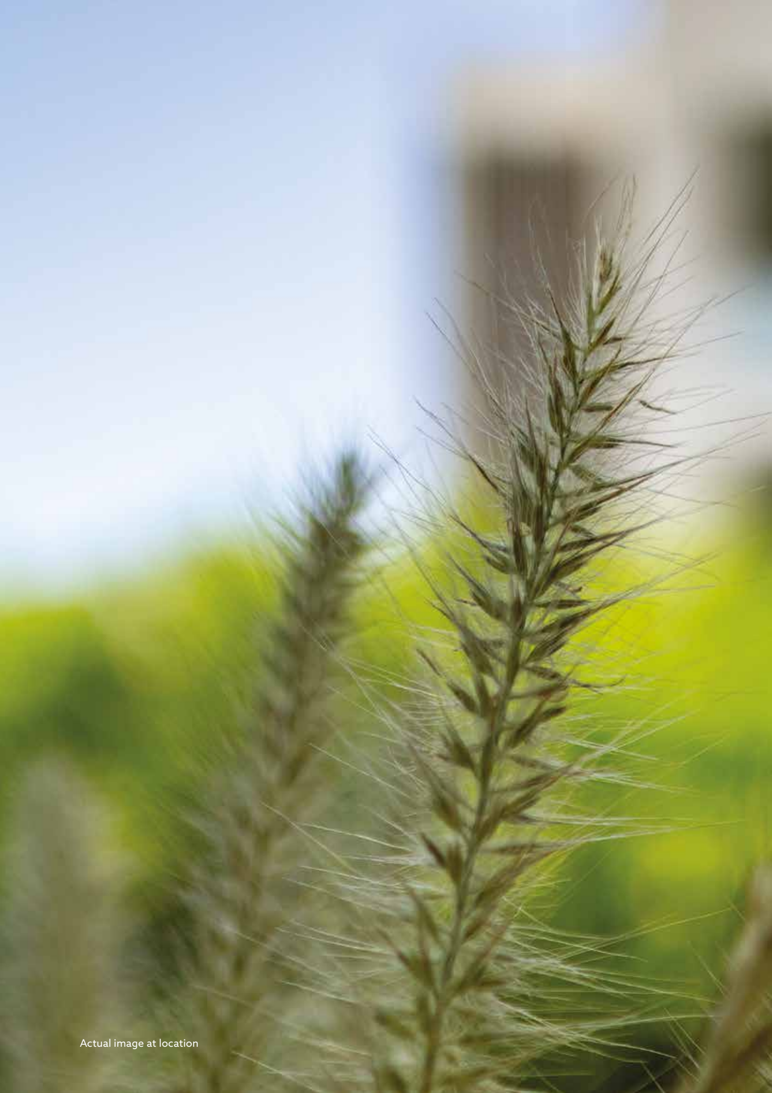
Actual image at location