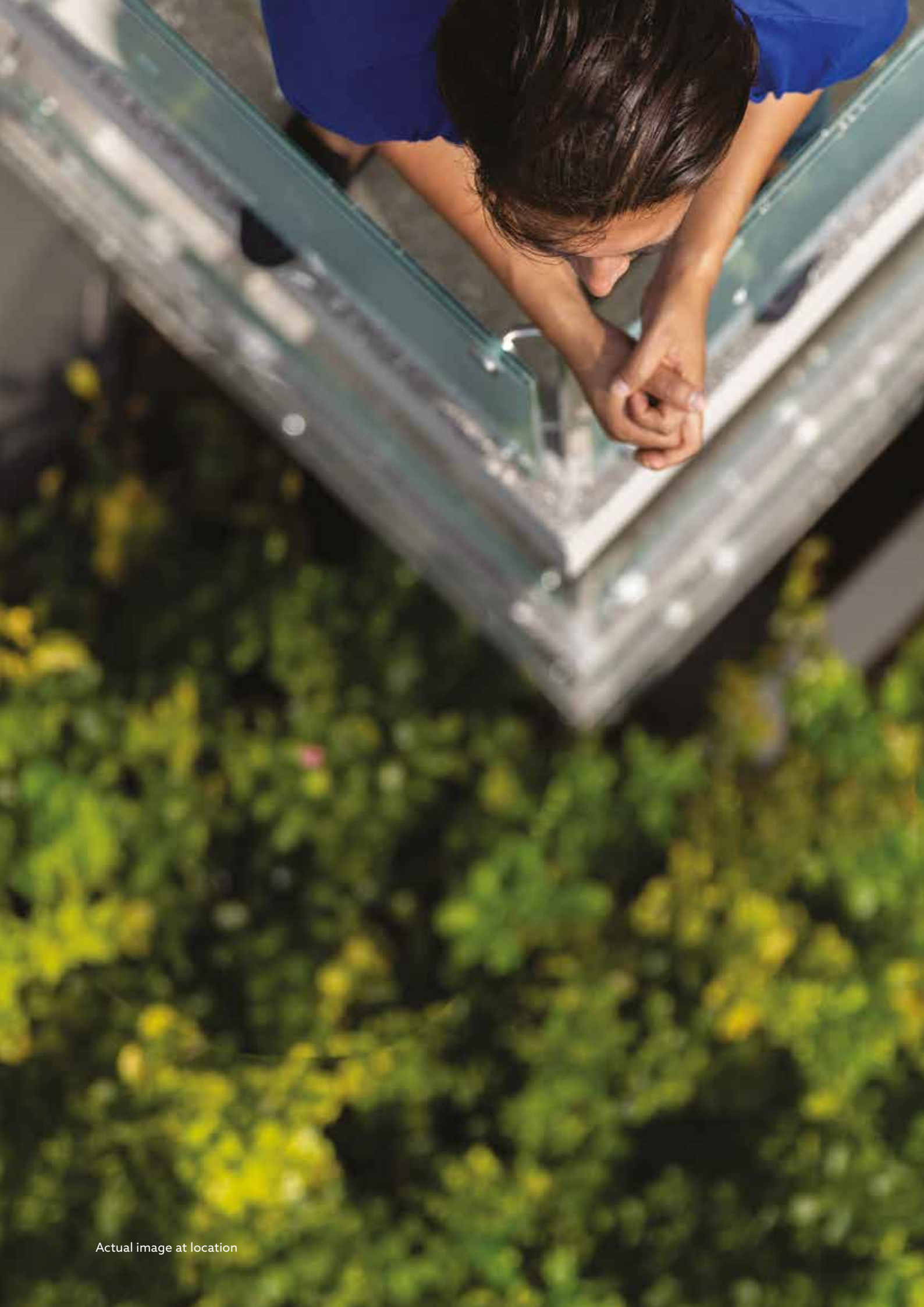
Actual image at location