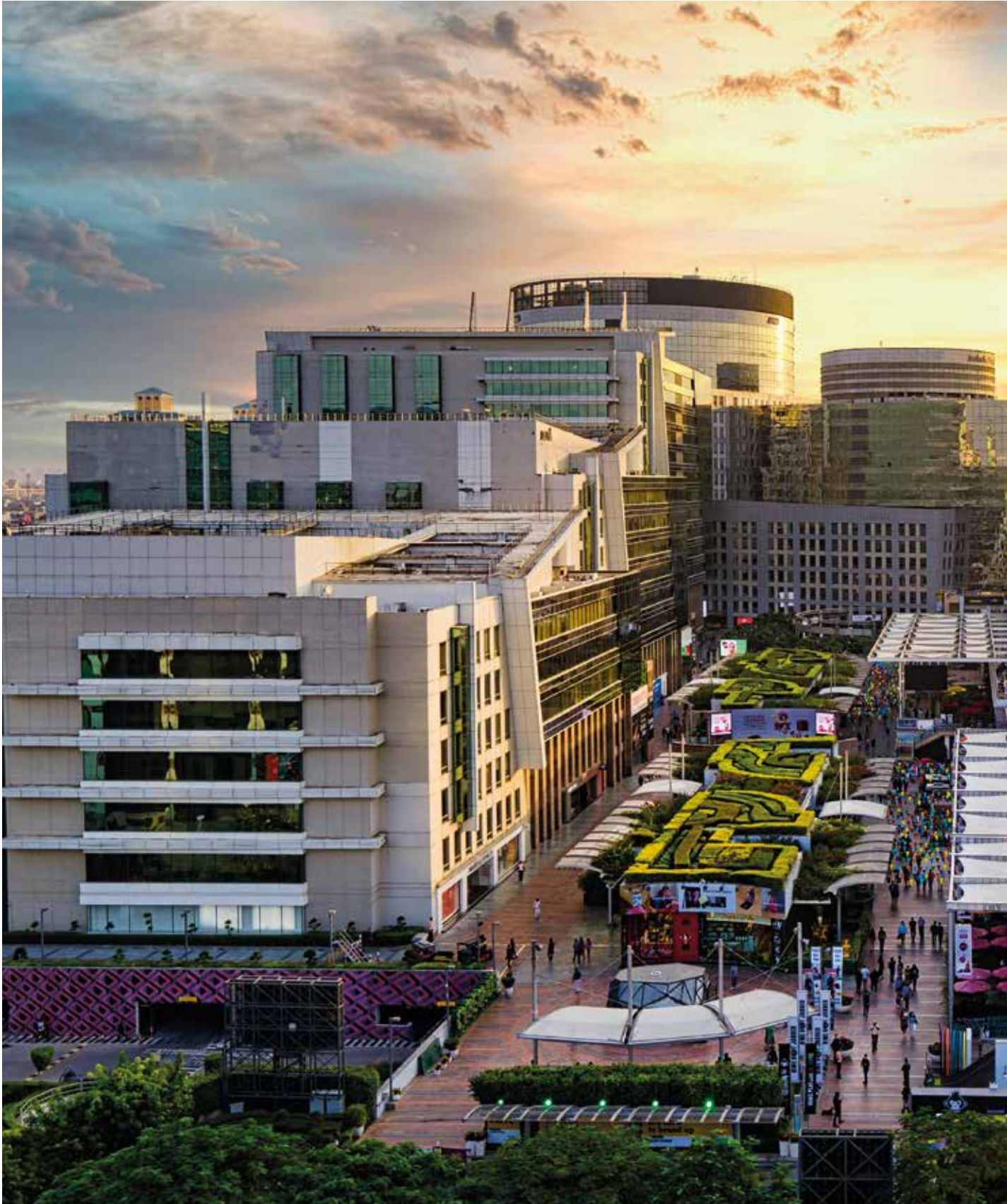
Actual image: DLF Cyberhub