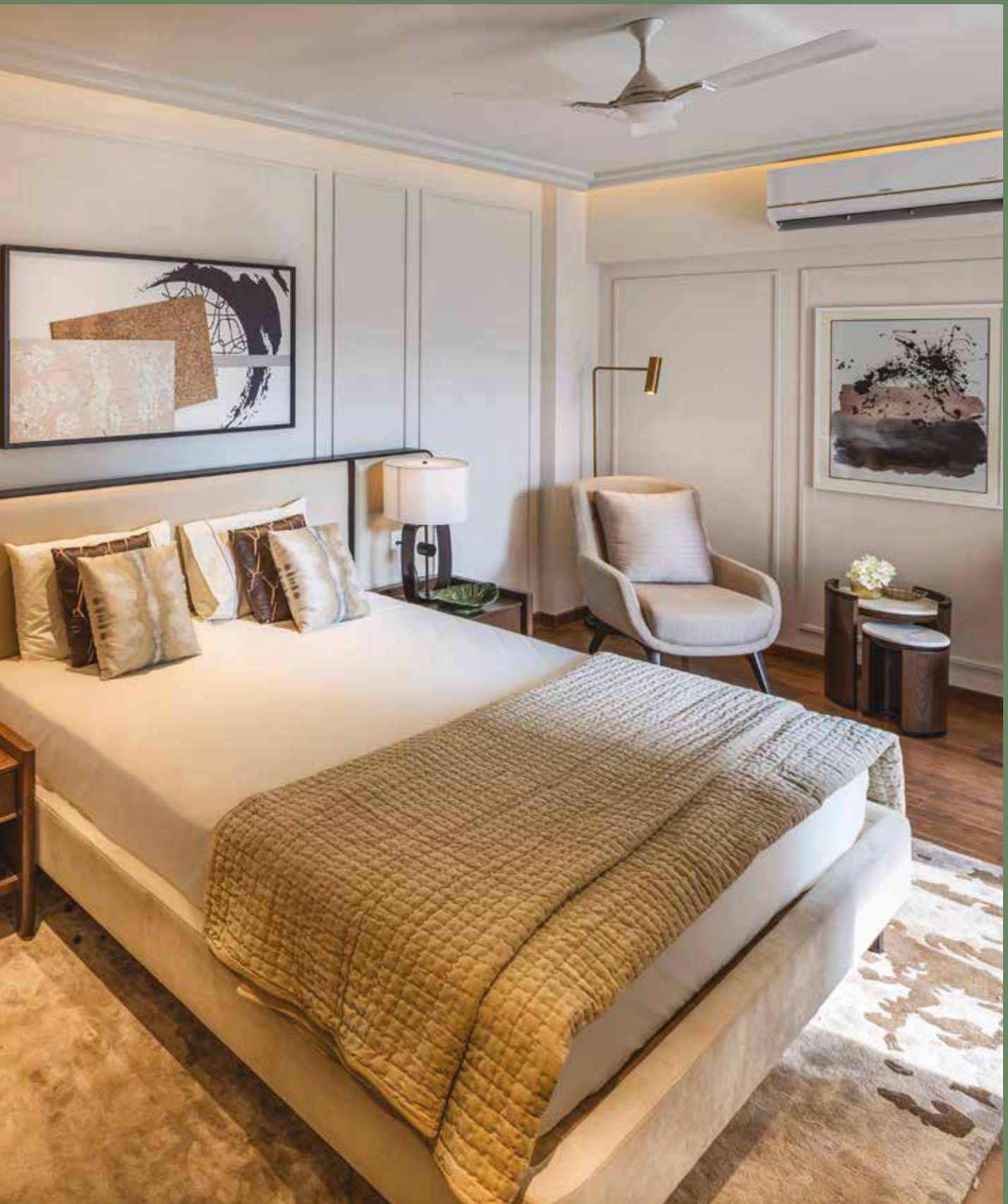
Actual Image: Independent Floors - Master bedroom

All fittings, fixtures and furniture shown are for representation/illustrative purposes only.