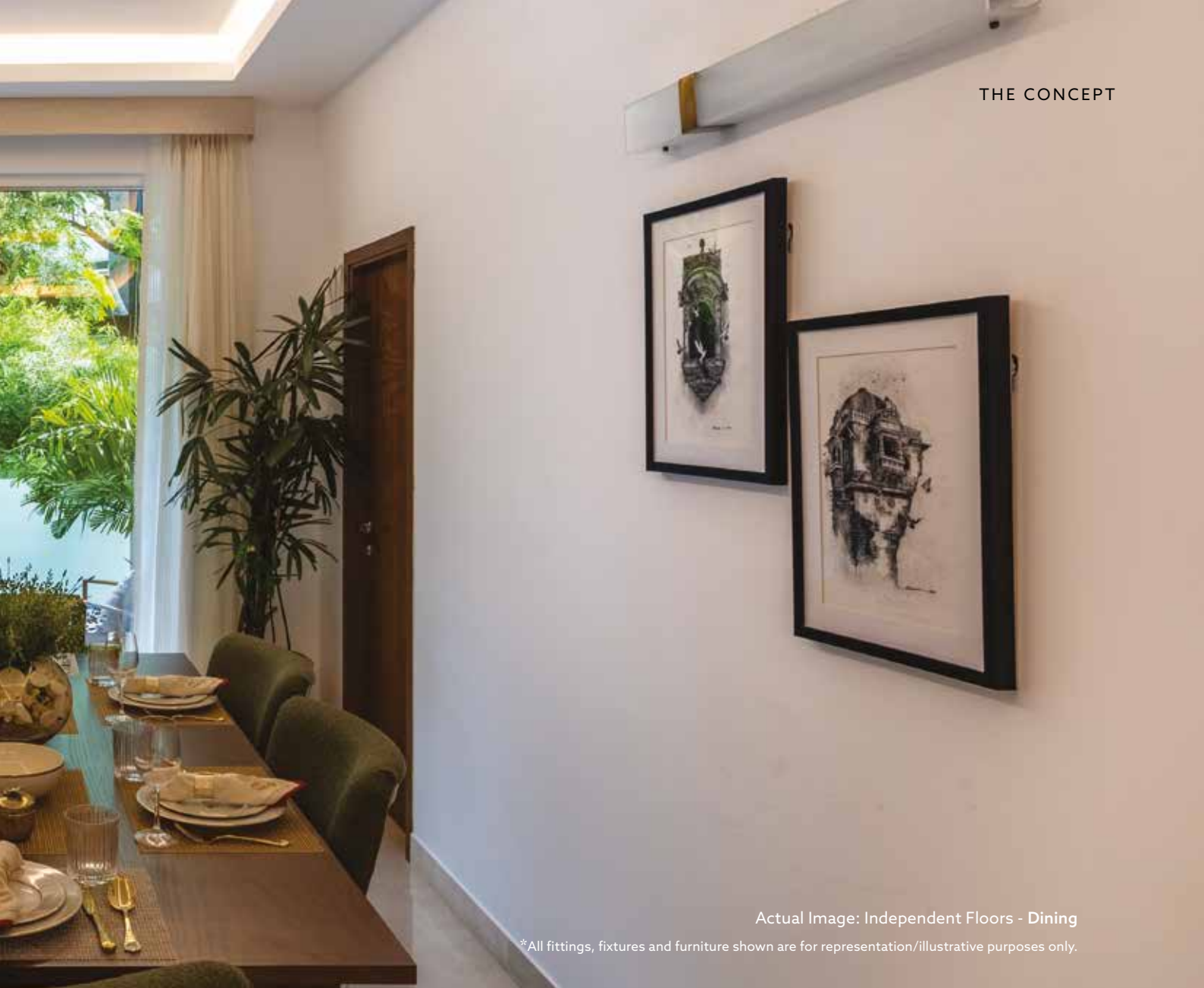
Actual Image: Independent Floors - Dining

*All fittings, fixtures and furniture shown are for representation/illustrative purposes only.